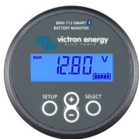
Bluetooth sensing BMV-712 Smart Battery Monitor