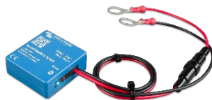
Bluetooth sensing Smart Battery Sense