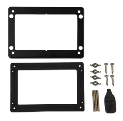
Accessories included with the GX Touch